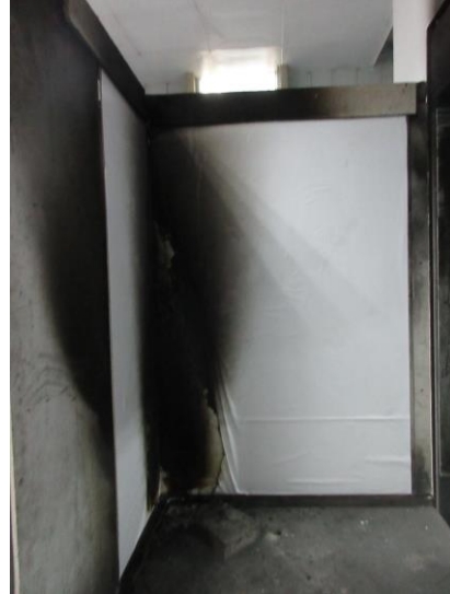
After Test (EN 13823)

SGS authenticate the photos on original report only