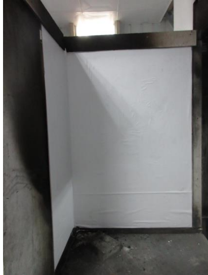
Before Test (EN 13823)